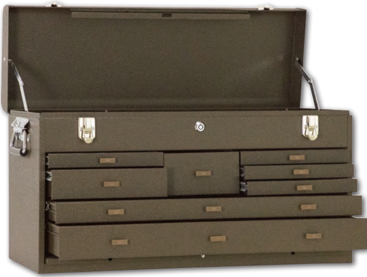
Model 526B: 8-Drawer Machinists' Chest

A two piece, welded friction drawer slides.