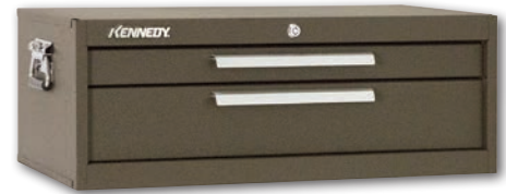
5150 2-DRAWER BASE