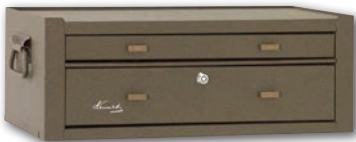
MC22 2-DRAWER BASE