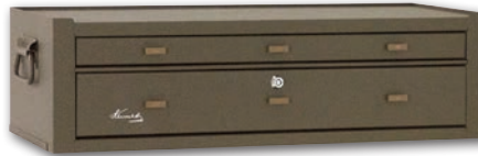
MC28 2-DRAWER BASE